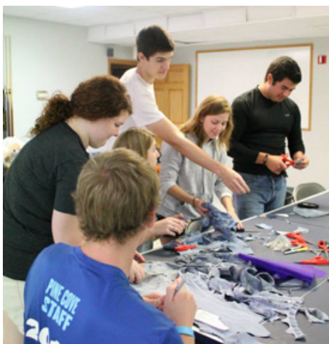
Senior seminar group members direct volunteers at a shoe cutting party

One group of students was inspired to help combat the problem of jiggers in Africa. Jiggers are flea-like organisms that burrows into the feet of people and can lead to the rotting of limbs and even death. Providing shoes to people in affected areas improves their health and gives the children a chance to attend school.