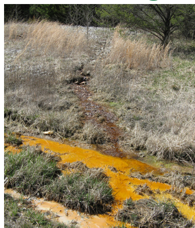
Acid mine drainage into Red Lake, located north of Columbia, MO at the former Peabody Coal Mine.